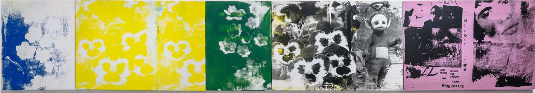
Jeff Hallbauer Köln Pictures , 2024 Silkscreen on Cotton 27.9 x 165.1 cm